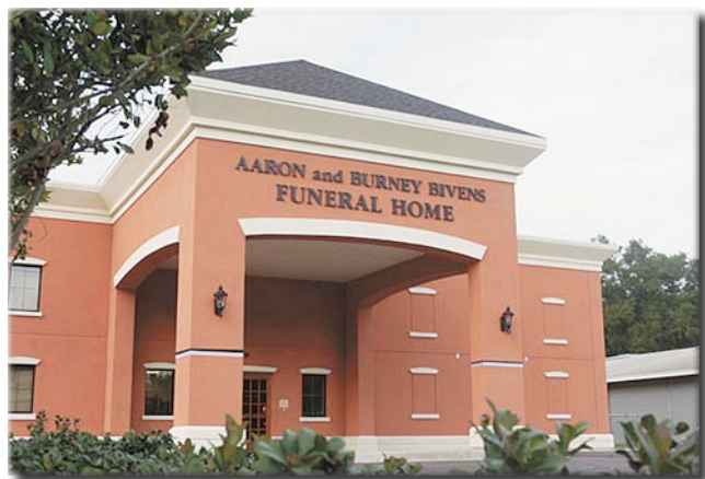
Aaron and Burney Bivens Funeral Home

nity. "We will serve the entire community with the same high degree of professionalism and commitment as we have done over the past 27 years in the law practice."