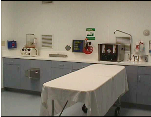
Custom cabinetry features adjustable shelves and plenty of storage.