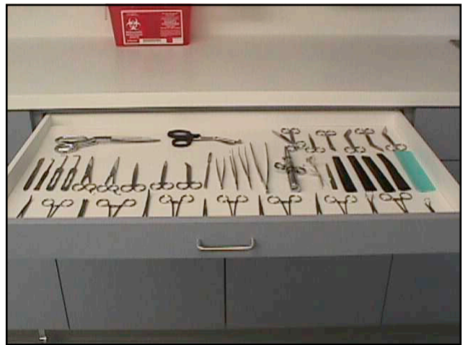
Shallow drawers to keep instruments at hand

and stain/moisture proof countertops make it possible to maintain an organized work area that promotes efficiency and provides the ergonomic benefit of having equipment right at hand.